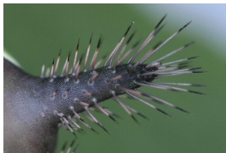
Fig 2. Close view of spines from the saddleback caterpillar ( Acharia stimulea ).

Caterpillars have developed an immense array of cutaneous appendages designed to repel would-be attackers or predators. One type of appendage is the hair-like seta, arising singly or in large bunches from