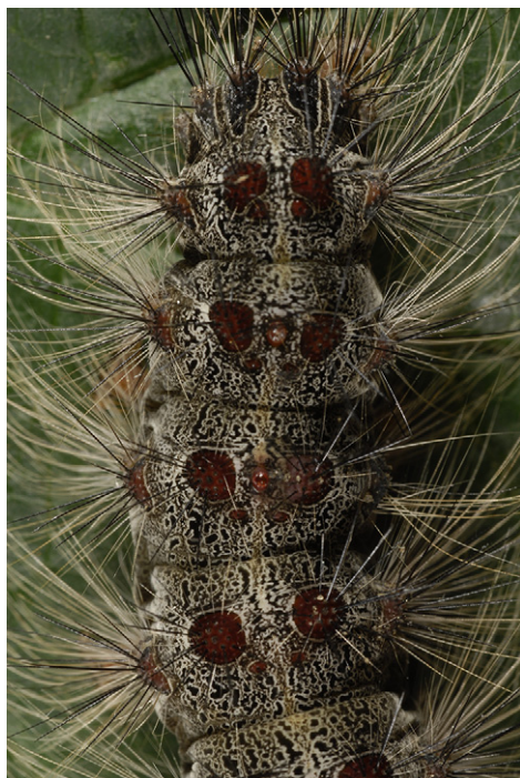
Fig 1. Close view of setae from a gypsy moth caterpillar ( Lymantria dispar ).